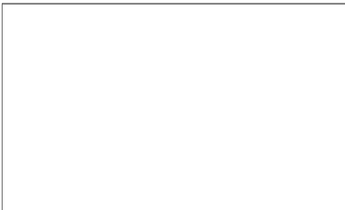
Google Earth Site Photo