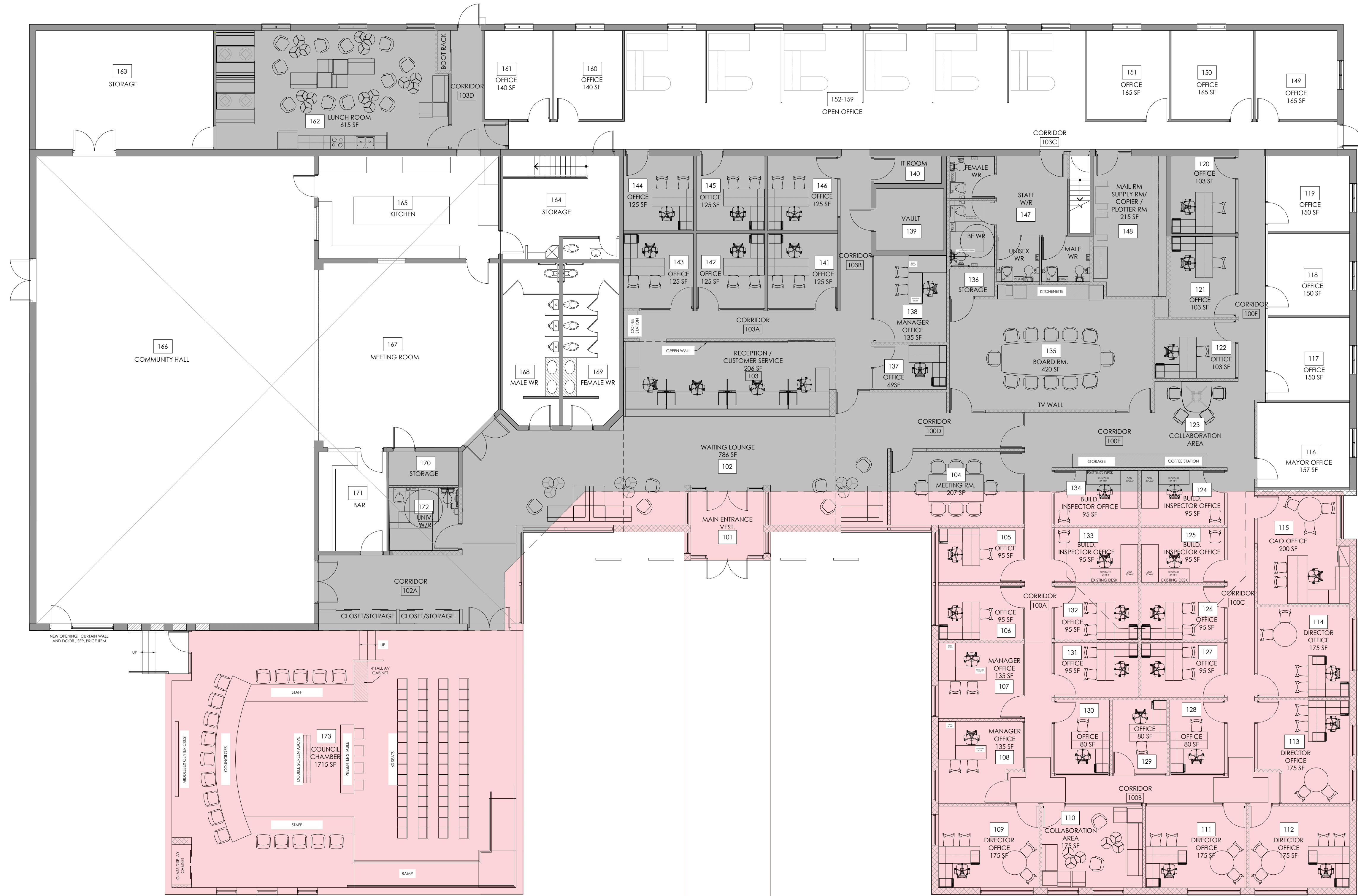
1 MAIN FLOOR LAYOUT A2.1