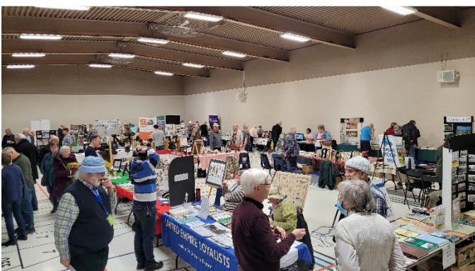
Crowd at the Heritage Fair

Events planned for the Anniversary Year include: Poplar Hill Picnic in June, Canada Day in July, Open House in August, Ilderton Fair September 29-October 1, and a Cemetery Tour in October. Look for more information on our Facebook page, Twitter, and webpage about these special events.