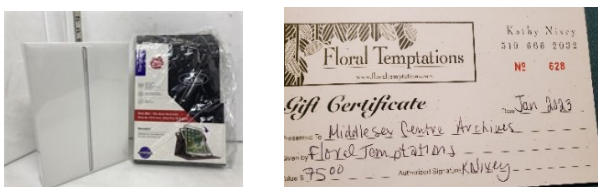
Some items from the auction

The annual MCA Heritage Fair was held on April 1 in the Delaware Community Centre. Each year, this