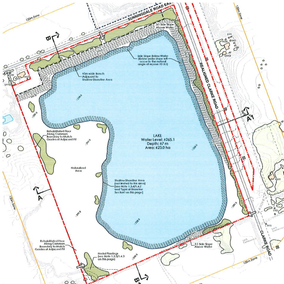
The proposed Final Rehabilitation design, depicting a substantially larger lake area as well as proposed natural environment features.