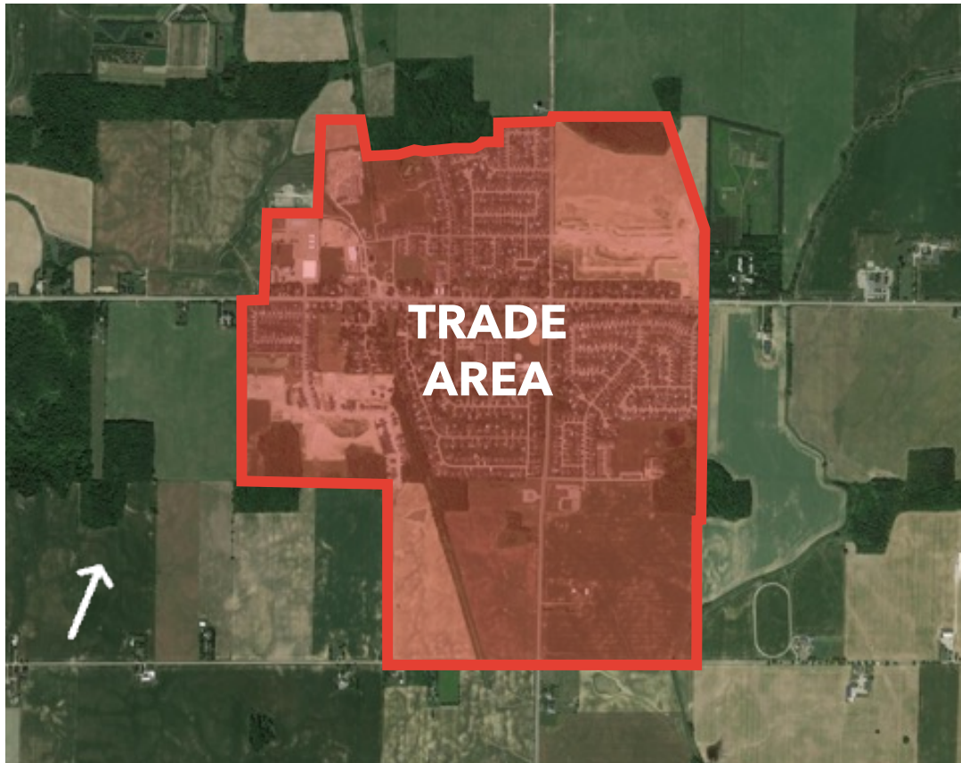
Figure 3.1 Map of Delineated Trade Area