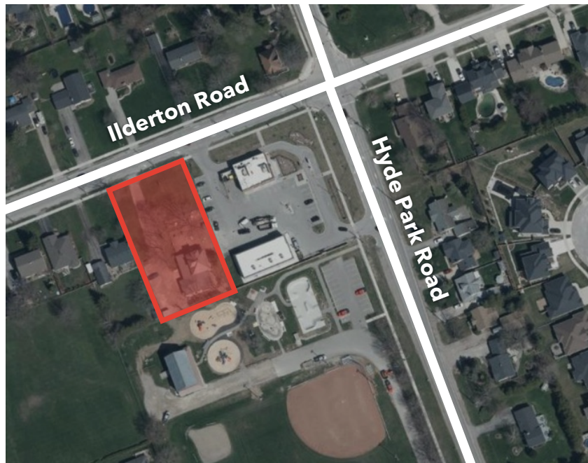
Figure 1.1 Location of the Subject Site